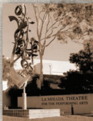
La Mirada Theatre for the Performing Arts 14900 La Mirada Boulevard

This roadway was once a dirt path. Biola University was built at this location in 1959. This was the location of the first City Council meeting and the former site of McNally Junior High School.