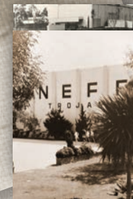
William Neff High School 14800 Alondra Boulevard

Originally one of two high schools in La Mirada, William Neff High School welcomed its first students in 1964 and closed in 1981.