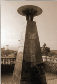
Eternal Flame 13700 La Mirada Boulevard

To the south of City Hall, an Eternal Flame burns above the names of La Mirada servicemembers who gave their lives for their country since 1960, the year the City was incorporated.