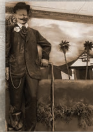
La Mirada Post Office 14901 Adelfa Drive

The lobby of the Post Office houses a display of historical photographs, figures and text depicting La Mirada's early years. It was dedicated in 1970.