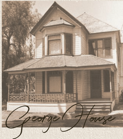
The George House, located at the Neff Estate, is the oldest home in La Mirada.

You can learn more about La Mirada's history by browsing the internet, reading books and going for a walking or biking tour.