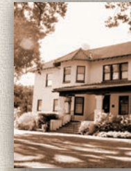
Neff Estate 14300 San Cristobal Drive

The Neff Estate covers 10 acres and includes three historic buildings. The Neff site was placed on the National Register of Historic places in 1978 in recognition of its role as a historical, educational and social center.