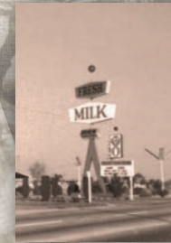
Valley View Farms 14101 Rosecrans Avenue