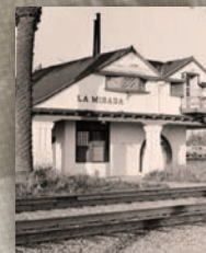
Train Depot Stage Road

The Train Depot built by Andrew McNally in the early 1890's was an iconic location. It was demolished in 1962.