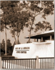
La Mirada City Hall 13700 La Mirada Boulevard

La Mirada City Hall provides a variety of public services for the community and is the location of City Council meetings. The first City Hall was located on the southeast corner of Rosecrans Avenue and Valley View Avenue.