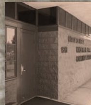
Windermere Park 15261 Cheshire Street

This park was once the location of the George Bell Reeve Estate.