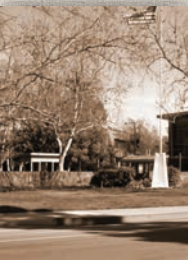
Biola University 13800 Biola Avenue

This roadway was once a dirt path. Biola University was built at this location in 1959. This was the location of the first City Council meeting and the former site of McNally Junior High School.