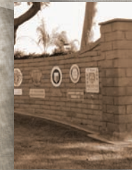
Stage Coach Stop Imperial Highway & Cordova Road

The southeast corner of this location was once the site of a stage coach stop. A historic marker is found at this location.