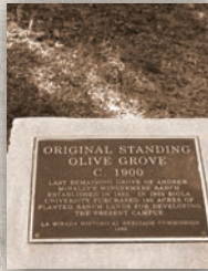
Olive Grove at Biola University

Located on the west side of La Mirada Boulevard across from the Civic Center, this site is home to the last contiguous section of olive trees in La Mirada. La Mirada once had a flourishing agricultural industry which raised olives and citrus fruit.