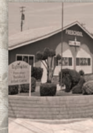
La Mirada First Fire Station 14340 Valley View Avenue

La Mirada's first Fire Station was located on Valley View Avenue. Current Fire Stations are located in the La Mirada Civic Center and on Beach Boulevard.