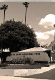
Olive Lawn Memorial Park 13926 La Mirada Boulevard

Olive Lawn Memorial Park is one of the few remaining family operated cemeteries in Southern California. It was the first business in La Mirada.