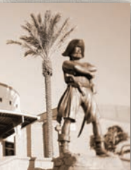
La Mirada Civic Center 13700 La Mirada Boulevard

The La Mirada Civic Center features several facilities serving the community such as City Hall, Splash!, Activity Center, Resource Center, Community Gymnasium, Los Angeles County Library and Community Sheriff's Station.